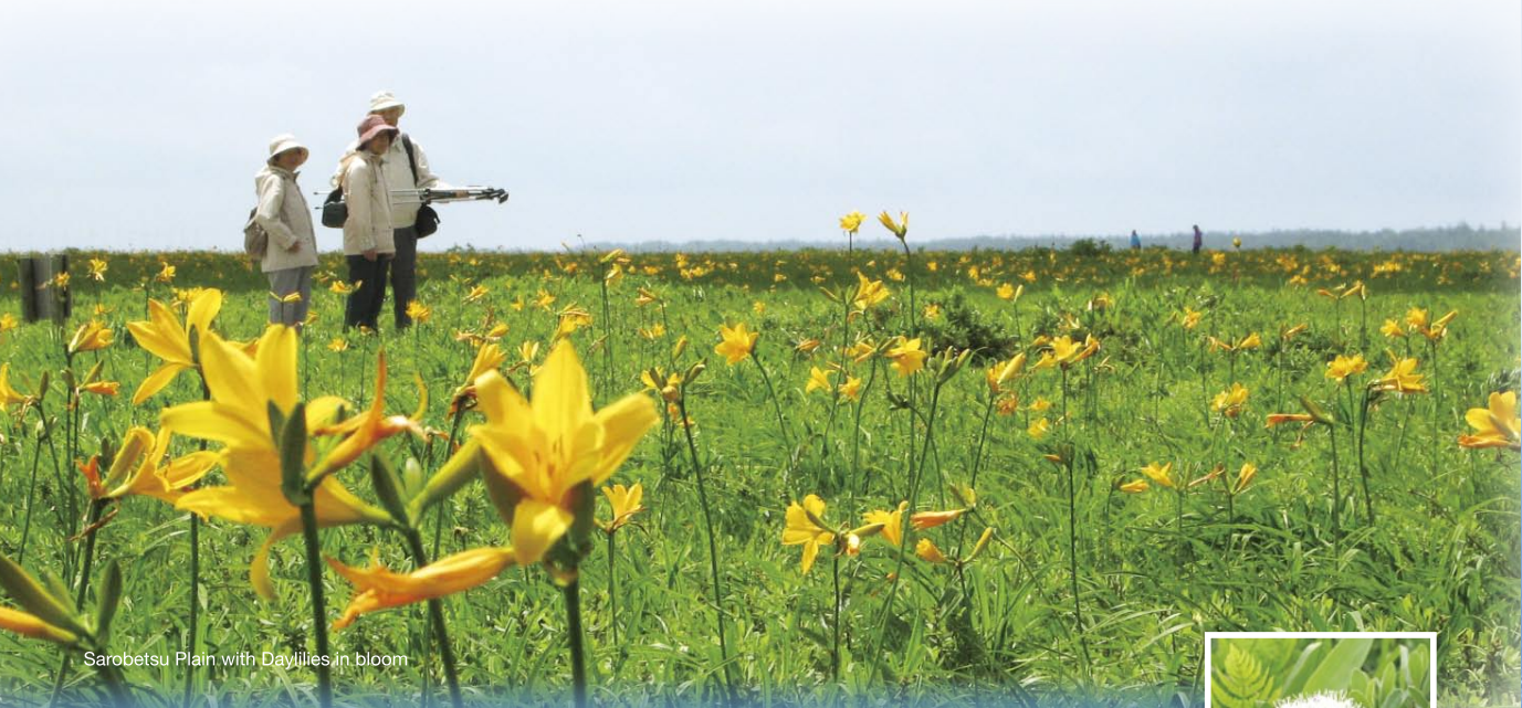
Sarobetsu Plain with Daylilies in bloom