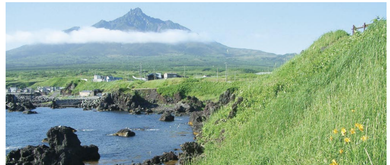
Viewing Mount Rishiri from Senhoshi Coast