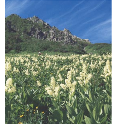
Flower garden of White Hellebore