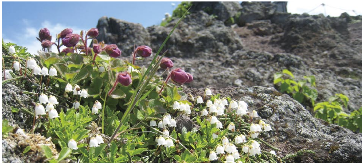
Clubmoss Mountain Heather and Ezo Azalea along the mountain trail

There are two trailheads, one situated at Oshidomari on the northern coast and another at Kutsugata on the western coast. Many visitors take the route from Oshidomari, where there is a harbor. Both routes require about 10 hours to ascend the mountain and return. You can enjoy the exceptional view from this independent peak on the ocean. However, you should be very careful of falling rocks and slipping on loose rocks since avalanches occur frequently, and scree fields and narrow ridges are prevalent near the summit. The trail is closed at the north peak, an elevation of 1,719m. Also, the Kutsugata route is for experienced mountaineers only since there are some dangerous areas from Mount Sanchozan upward. Please follow the Rishiri Rules to avoid harming the plants when climbing Mount Rishiri.