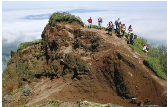
Near the summit of Mount Rishiri