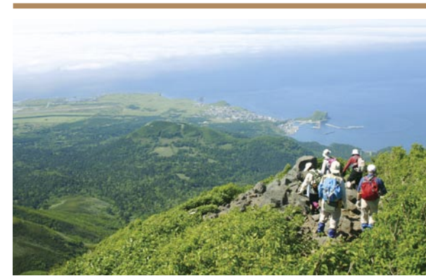
Viewing Oshidomari from the mountain trail