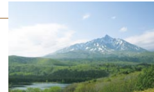
From Numaura Observatory to Mount Rishiri

Otadomarinuma Swamp is situated in the southeast of the island surrounded by low hills on three sides. In contrast to Himenuma Swamp, Numaura Marsh, with many types of the Common Reed ( Phragmites australis ) and the Calamus ( Acorus calamus ), extends along the lakeshore. The sharp profile of Mount Rishiri, different from the one seen from Himenuma Swamp can be seen beyond a forest of Ezo Spruce ( Picea glehnii ). There is a wooden walkway at Minamihama Marsh, which is a high moor, situated about 2km to the west.