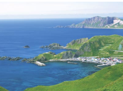
Viewing the west coast (Cape Sukai and Cape Gorota)

Sea cliffs prevail on the west coast of the island, but it is difficult to view the whole coast from the land. However, a good view of Jizoiwa Rock and Nekojiwa Rock, along with Momojiwa Rock towering in the background can be seen at Motochi View Point. Sightseeing by sea kayaks is possible on days when the waves are gentle.