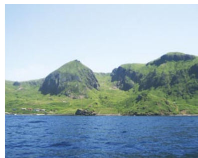
Viewing Momojiwa Rock from the ocean