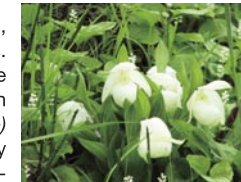
Rebutouchi Slipper Orchid

Lake Kushu has an area of about 60ha, and is separated from the sea by sand dunes. On its south bank, there is a wetland where a wooden walkway is set up. The Asian Skunk Cabbage ( Lysichiton camtschatcense ) blooms in the spring, and the Kamchatka Lily ( Fritillaria camtschatcensis ) in the early summer. There is a campsite on the lakeshore.