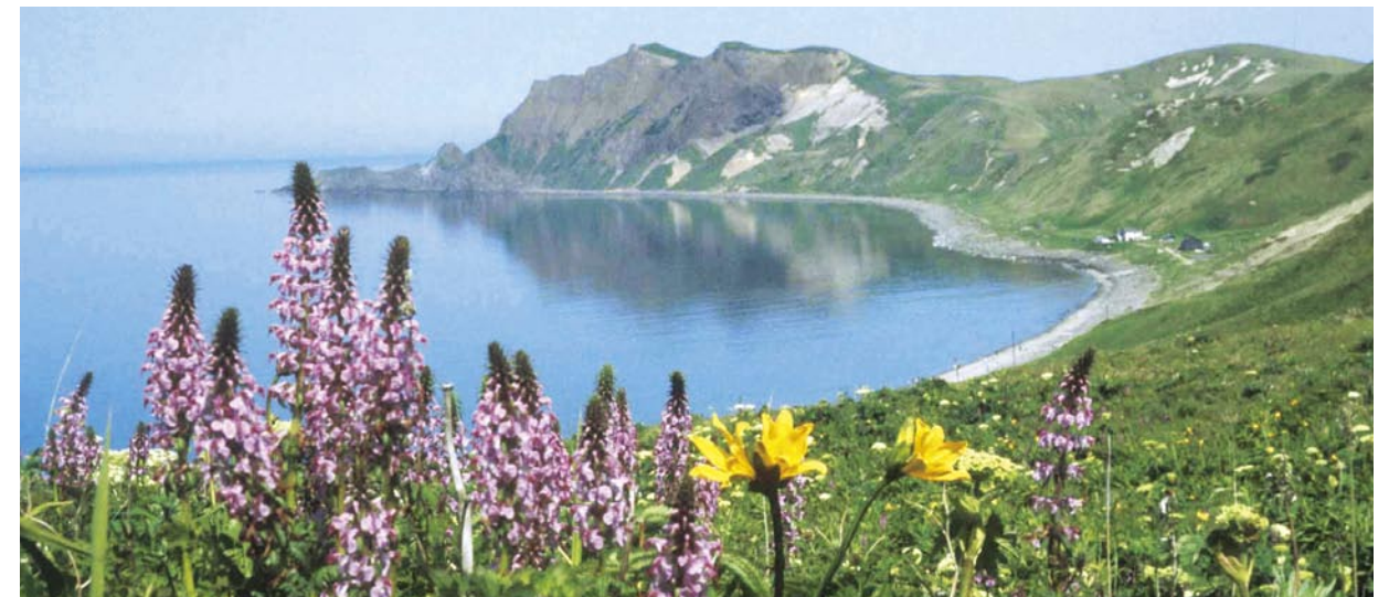
The four-hour route through continuous flower gardens

Mount Rebutouchi has an elevation of 490m and is the highest peak on Rebun Island. Although the elevation is low, Mt. Rebutouchi is covered with shrubby thickets of species such as the Creeping Pine and the Crowberry ( Empetrum nigrum var. japonicum ). In the entire summit area, the atmosphere is similar to that of the alpine zone of central Honshu. You can view all of Rebun Island from the summit, and can even see Sakhalin.