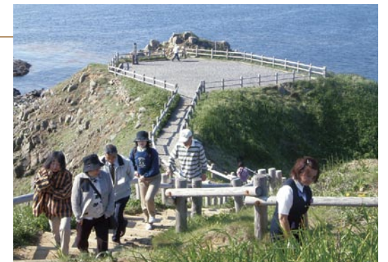
The observatory at Cape Sukoton