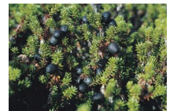
Berries of the Crowberry