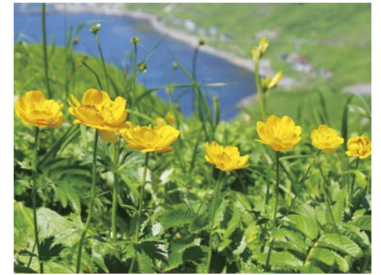
Flower gardens on Momoiwa Route