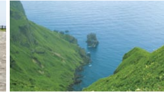
Nekojiwa Rock viewed from Momoiwa Route