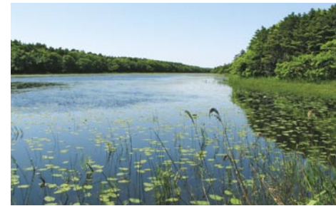
Serene swamps in sand dune thickets

Thickets on sand dunes extend between Sarobetsu Plain and the sea. A few rows of sand dunes extend 40km parallel to the coastline, and wetlands and small ponds continue in the lowlands between the sand dunes, creating scenery rarely seen anywhere else, allowing you to appreciate the profound primeval feel. You can enter the coastal forest area from Wakasakanai (among other places). However, hiring a local guide is recommended since you can easily get lost on the poorly marked walkways.