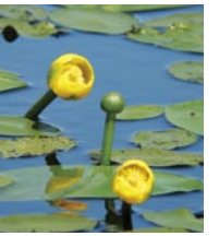
Least Water Lily

Thickets on sand dunes extend between Sarobetsu Plain and the sea. A few rows of sand dunes extend 40km parallel to the coastline, and wetlands and small ponds continue in the lowlands between the sand dunes, creating scenery rarely seen anywhere else, allowing you to appreciate the profound primeval feel. You can enter the coastal forest area from Wakasakanai (among other places). However, hiring a local guide is recommended since you can easily get lost on the poorly marked walkways.