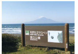
Yukuru Observation Point