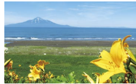
Mount Rishiri from Sarobetsu Coast

There are many good view spots such as Yukuru and Wakasakanai on the Wakkanai Teshio Prefectural Road stretching along the coast of the Sea of Japan from Wakkanai. Although located outside of the national park, there are also observatories on National Route 40 on the inland side, including Miyanodai in Toyotomi-cho and Meizandai in Horonobe-cho.