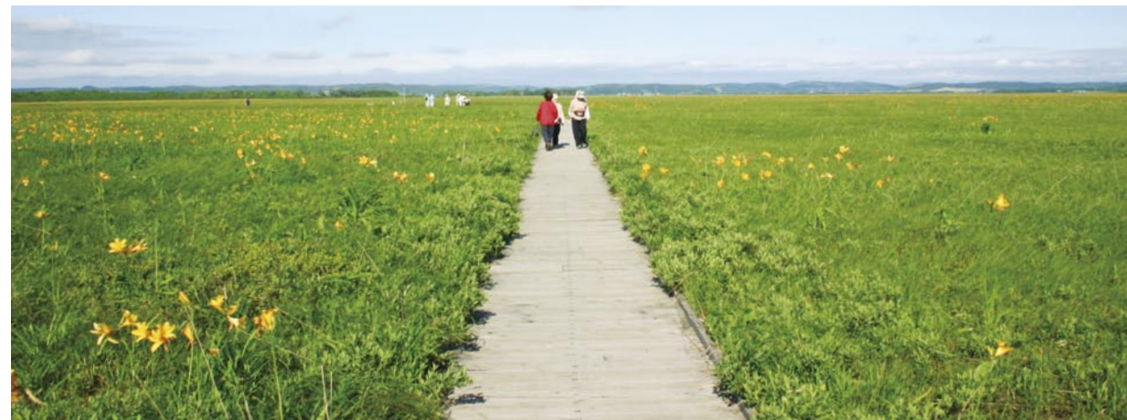
Sarobetsu Wetland with Daylily in bloom

In addition, from the wooden walkway right in front of Horonobe Visitor Center, you can see wetland plants as well as aquatic plants such as the Least Water Lily ( Nuphar pumila ) and the Water Shield ( Brasenia schreberi ). Besides birds of the grasslands, many waterbirds gather at Naganuma, Penkenuma and Pankenuma Swamps, and farms nearby during the migration season.