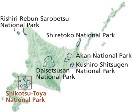
Shikotsu-Toya National Park