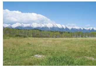
From Tokachi-Mitsumata to Ishikari Mountain Range

The Higashi Daisetsu Area is a highly mountainous zone with unique charms. It includes the Higashi Daisetsu/Ishikari Mountains, Lake Shikaribetsu and Lake Nukabira which, though man-made, offers a splendid view. Tokachi-Mitsumata is surrounded by forests. Unlike the Omote Daisetsu Area, the Ishikari Mountain Range consists of non-volcanic mountains. The headwaters of the Tokachi River at the eastern base of Mount Tomuraushi have been designated as a Wilderness area.