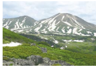
From Tomanokkoshi to Mount Asahi

The Omote Daisetsu Area is the core area of the Daisetsuzan National Park. It consists of the Daisetsuzan volcanic group and a grand plateau extending to its south. Daisetsuzan volcanic group—commonly referred to simply as “Daisetsuzan”—includes dominant peak of Mount Asahi and other mountains. There are deep valleys at the bases of the mountains to the east and west. Standing in the south of the Omote Daisetsu Area, Mount Tomuraushi is outstanding for its gentle, undulating slopes, and garden-like beauty.