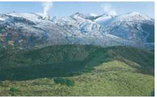
The view of Mount Tokachi from a distance

The Tokachi Mountain Range is a volcanic group with Mount Tokachi, an active volcano, as the central peak. Its elevation approaches 2,000m, and it runs from the northeast to the southwest. It is situated to the south of the Omote Daisetsu Area. Unlike Omote Daisetsu, the Tokachi Mountain Range is an extended ridge consisting of several steep peaks, and the passes between them, with deep canyons extending downward on either side. At lower elevations, the skirts of these mountains extend outward more gently as far as the Biei and Kamifurano districts. The view of this chain of mountains from these districts, rising above farmlands and forests, is simply breathtaking.